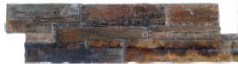
MULTI COLOUR SLATE