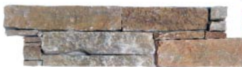
RUSTIC MICA SCHIST