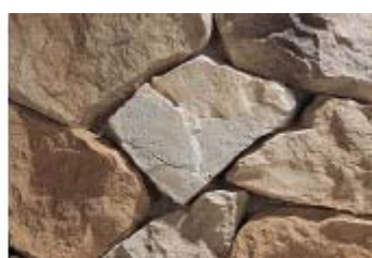
CHATEAU COUNTRY RUBBLE