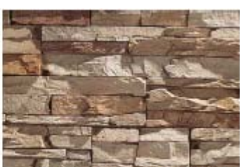
MOUNTAIN BLEND STACKED STONE