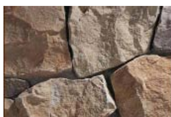
TUSCANY COUNTRY RUBBLE