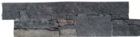
BLACK MICA SCHIST