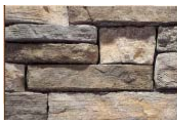
SYCAMORE MOUNTAIN LEDGE