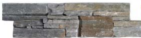
BULU GREY SLATE