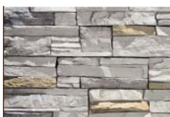
OLD ENGLISH STACKED STONE