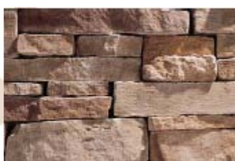
BUCKSKIN MOUNTAIN LEDGE