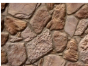
COLONIAL BROWN RANDOM MIX