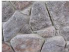
HIGH COUNTRY GRANITE

Special Instructions: Please use the colours indicated in this information as a guide only. Not all products are kept in stock at our 4 Melbourne Brick Superstores, we recommend that you call prior to coming in to confirm the item in stock. If not, we are happy to arrange for the stock to be bought in for you. Please allow approximately 1 week from order date for delivery (delivery fee may apply).