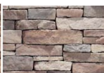
WARM SPRINGS MOUNTAIN LEDGE